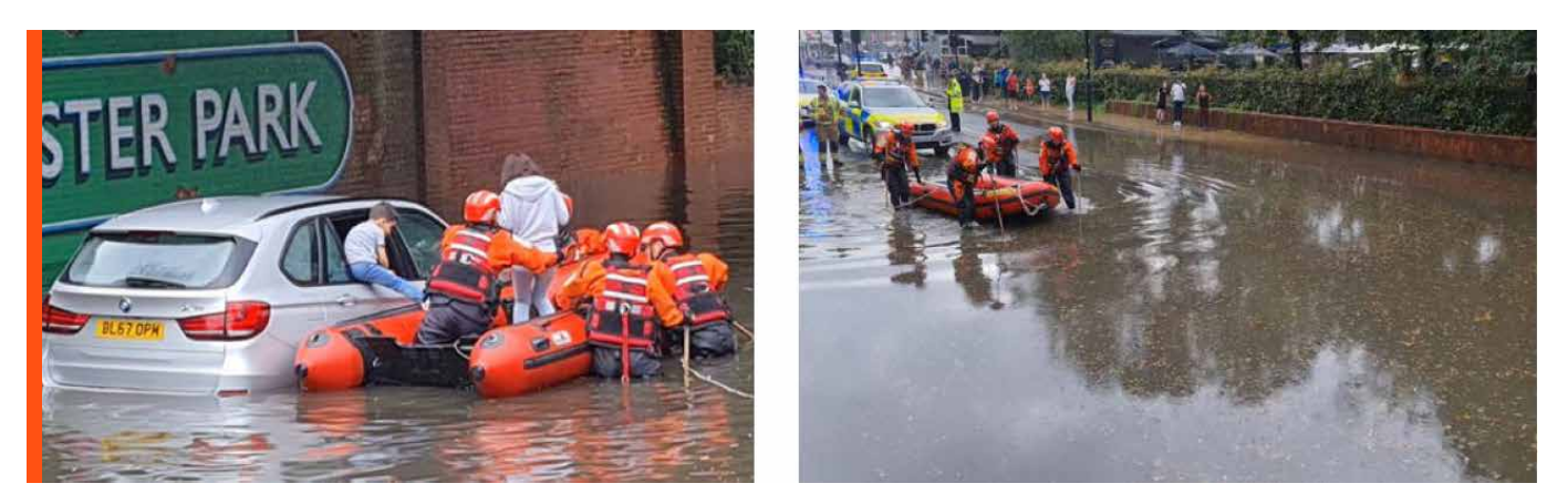
Summer flooding in Worcester Park, London.

Fluvial flooding occurs when the water level in a river, lake, or stream rises and overflows onto the neighbouring land, while storm surges are generated from high water levels along coastal areas and are often wind generated. Therefore, this paper does not cover major flood events, such as Hurricane Katrina and the impact on New Orleans.