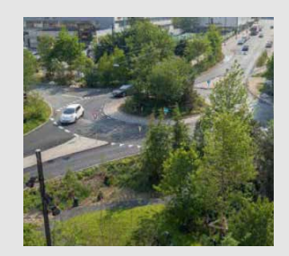
Sankt Kjelds Plads