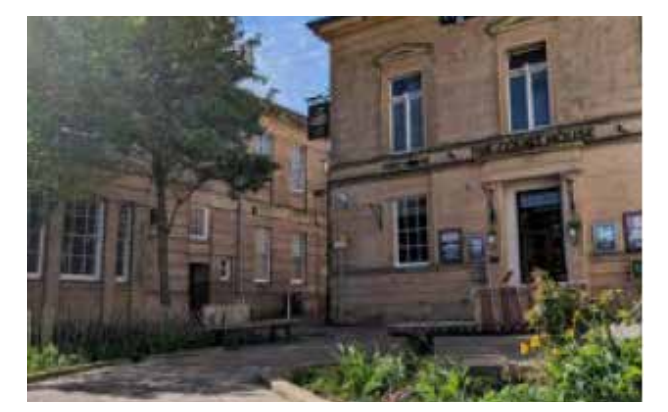
The Court House Rain Garden, Mansfield

However, aboveground sustainable drainage solutions have other advantages as they prevent stormwater from reaching the sewers and mixing with sewage water. These solutions prevent dirty water from reaching rivers and other natural water courses while also reducing the amount of dirty water sent to Severn Trent's water treatment plants, saving energy and chemical use.